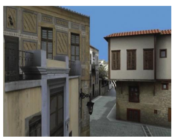
3D model of Xanti, Centre for Educational Technology

Europeana has also been acting on the recommendations of the CARARE report. In February 2012 a new version of the Europeana interface will include a search facet for 3D to enable users to find this exciting content more easily. The modifications included an update to the EDM and ESE, and to their ingestion toolkit in order to add 3D as a type in Europeana.